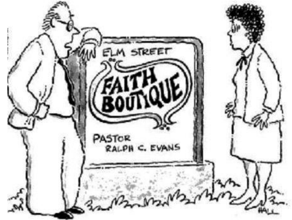
"Our growth consultant thinks the term church sounds outdated."