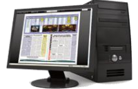
Web pageable version

Published bi-monthly Digest-style of content, full content on web